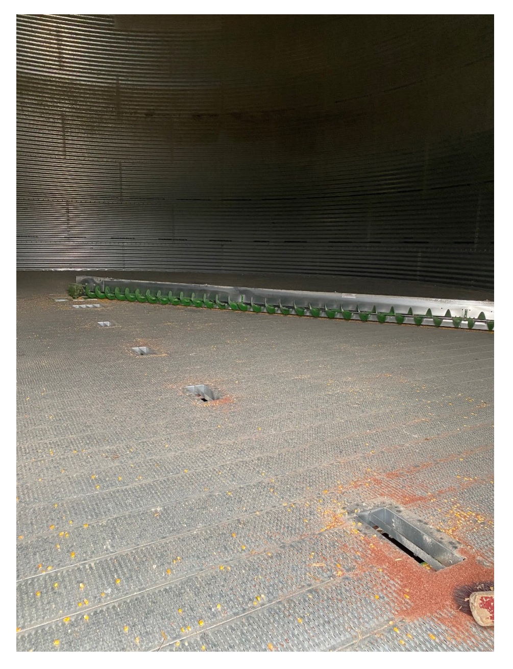
All 48 Foot Bins have Power Sweeps